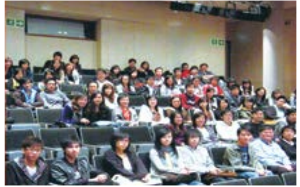
Students participating in class

2) Students may apply for government scholarship, grant and loans.