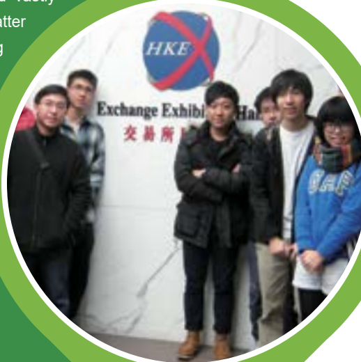
Students visiting Hong Kong Exchanges and Clearing Limited