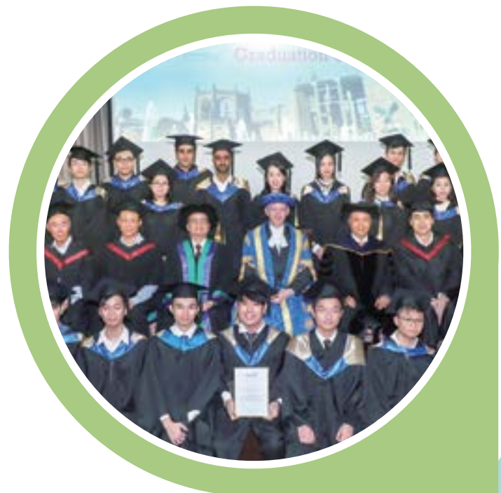
Graduation Ceremony 2019

Graduates may pursue postgraduate programmes offered by CityU, or other local and overseas universities. In particular, graduates of the programme have successfully enrolled in MSc in Computer Science offered by the Department of Computer Science, CityU and MSc in Electronic Ecommerce jointly offered by the Department of Computer Science and the Department of Information Systems, CityU. Relevant MSc or MBA programmes offered by Coventry University may also be available for further study in the UK, subject to application.