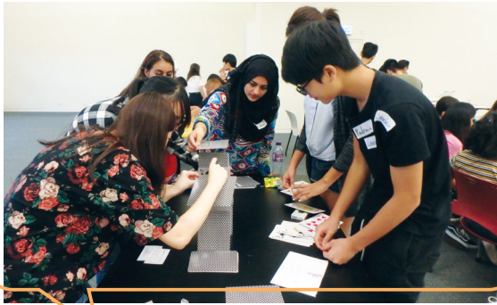
Team Building Workshop